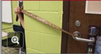
Belt around door handle