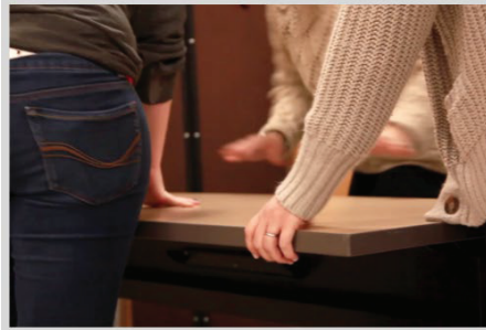
Stack Desks and Chairs