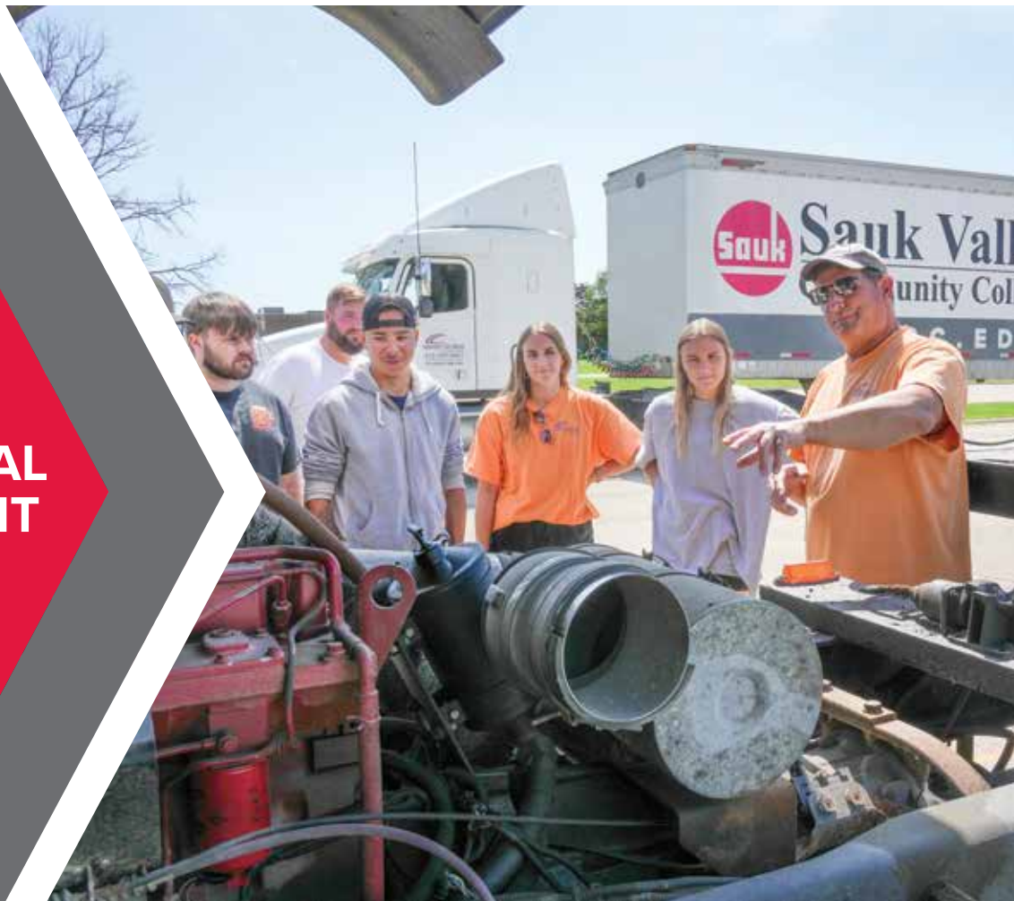
CDL Truck Driver Training