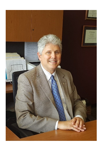
Greetings from Sauk Valley Community College!

Whether you are a student, employee or visitor, Sauk Valley Community College takes your security and safety seriously. SVCC has trained security staff on-campus 24 hours a day, seven days a week. Additionally, SVCC security works closely with Lee County Sheriff's Department and the Illinois State Police to ensure the safest campus environment possible. An Emergency Preparedness Committee regularly meets to discuss and improve Sauk's emergency procedures, and all of Sauk's employees are trained to initiate those procedures. While being trained for every emergency situation is not possible, Sauk will always do its best to respond quickly and professionally to any emergency situation.