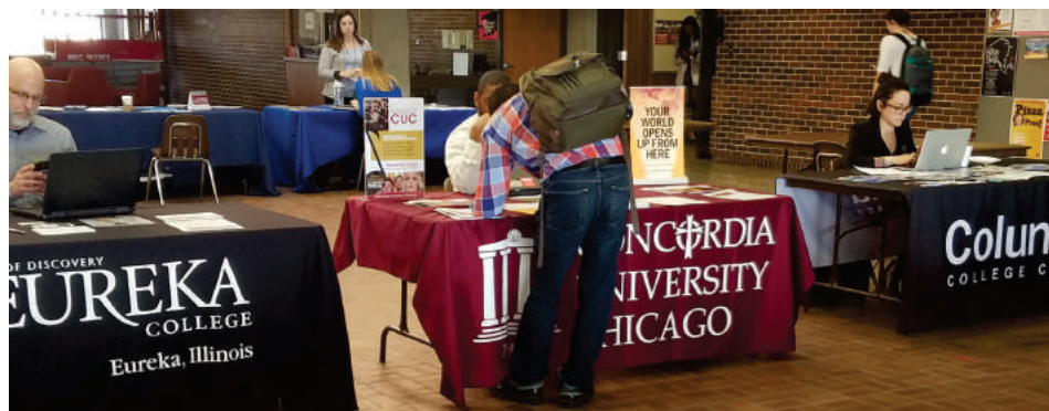
Representatives from Illinois private colleges held event at SVCC

widely, but the consensus seems to mostly point toward students not having the time and/or feeling that the increased tuition is simply too much for them to pay