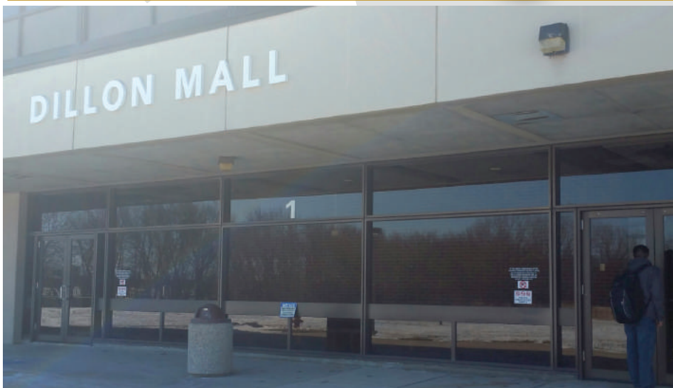
The East Mall is now called the Dillon Mall.