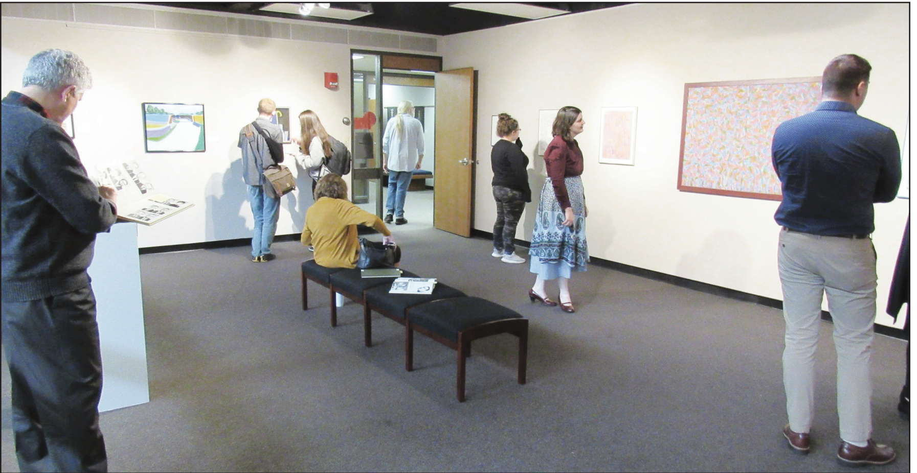
A scenes from the Robert Matter Gallery Reception.