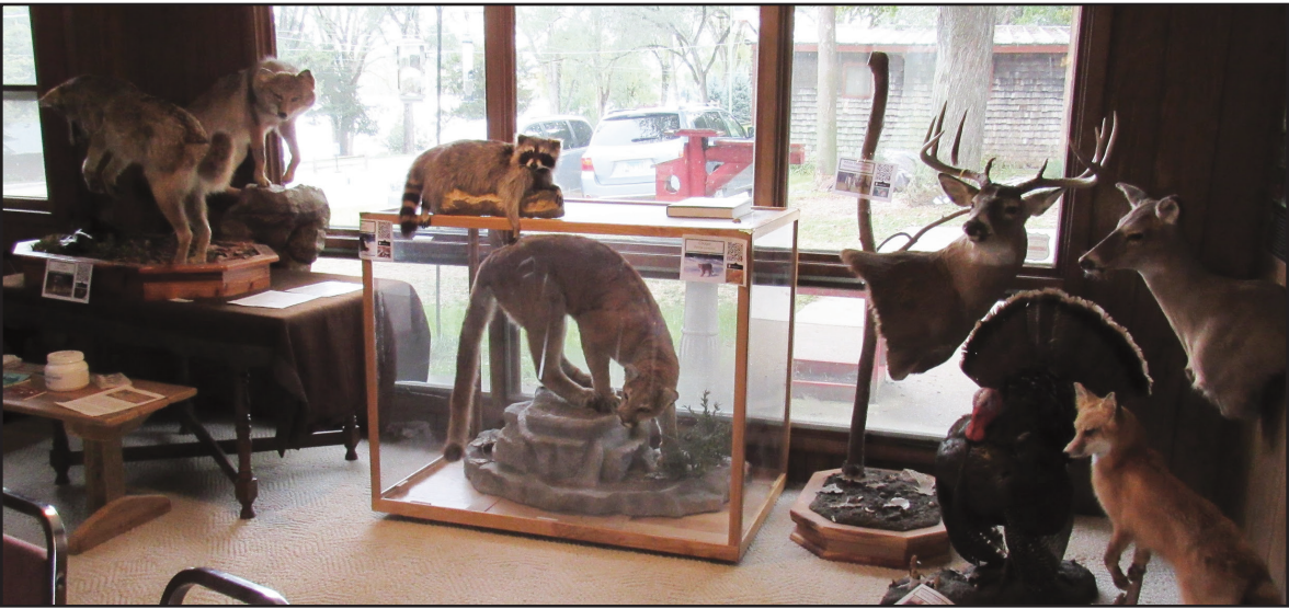
Taxidermy found inside of the nature center.