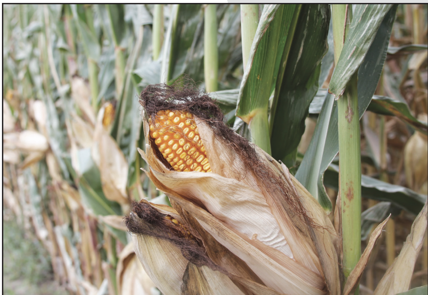
Corn still grows on green stalks late into October has rains caused a late planting season.